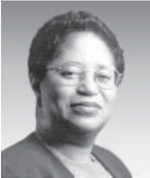
Shirley Ann Jackson